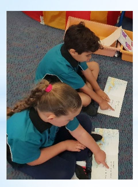
Literacy at BWPS