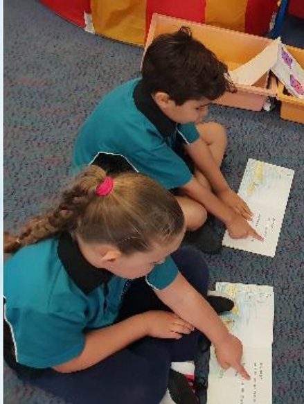
Literacy at BWPS