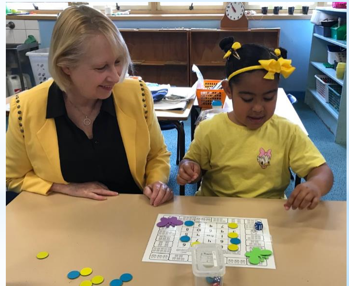
Numeracy at BWPS